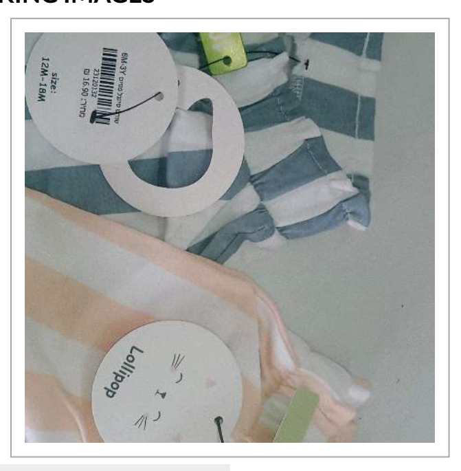
Accessories Image 1 Notes