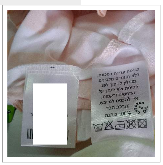
Accessories Image 4 Notes