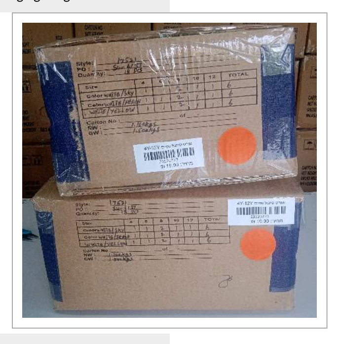
Packaging Image 3 Notes