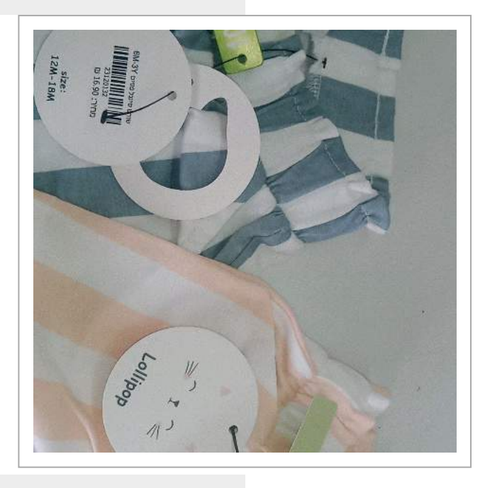
Accessories Image 2 Notes