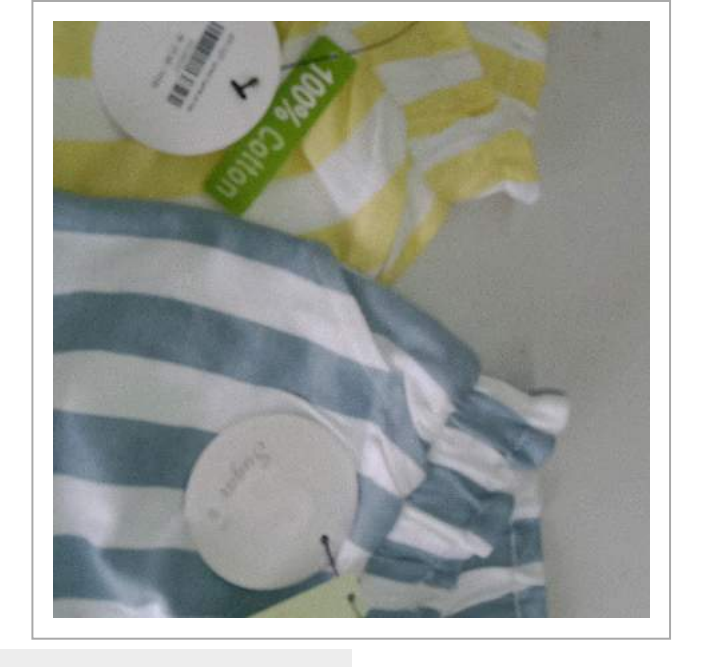
Accessories Image 5 Notes